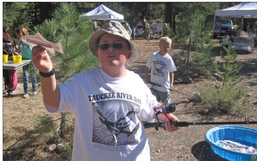
Children learn about Lake Tahoe fish and historical fishing practices with the museum's magnetic fishing game set up (above) on October 16 for Truckee River Day River Fair at the Granite Flat campground and, earlier in the month, at the U.S. Forrest Service's Kokanee Salmon Festival at the Taylor Creek Visitor Center adjacent to Camp Richardson.

Administration from Cal Poly San Luis Obispo where she was involved in planning community events and races. She spent one more year in sunny San Luis Obispo as a naturalist for Rancho Outdoor School, teaching kids about environmental science and leading classroom groups on wilderness hikes. This summer she worked for Tahoe Meadows Historic District in South Lake Tahoe as summer supervisor, coordinating and running the community's events. She is thrilled to be our museum assistant, learn how the Museum runs, interact with the community, and take in all the fascinating Tahoe history.