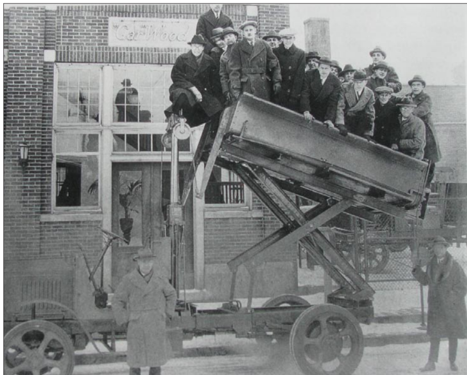
With 18 men in the cargo bed, this truck demonstrates the lifting power of Wood's patented hydraulic hoist which would eventually be used in dump trucks around the world, making Gar Wood and his wife millionaires.

In 1916 he bought his racing boat, Miss Detroit . When he went to visit her at the Chris Smith & Sons Boat Company in Algonac, Wisconsin, he decided to buy a large share of the company as well. Chris Smith and Gar Wood were an excellent team, with Smith's knowledge of wood-working and Wood's engineering ability. Together they would eventually start the Miss America dynasty of boats. Smith and Wood worked together for about five years before Smith left to focus on pleasure boats while Wood was captivated with racing. Wood would go on to win the Gold Cup and the international Harmsworth Trophy nine times.