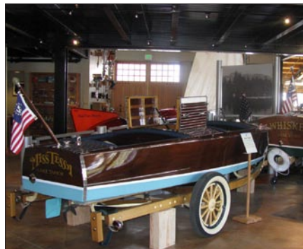
Miss Tessa , the museum's 1930 Dodge runabout, joined Whiskey , a 1935 20-ft. Gar Wood Utility, the oldest know to exist.

The museum's Gar Wood runabout Miss Tahoe has been at Western Runabouts receiving new varnish as she is getting ready to be placed on exhibit soon. White Smoke , the Sea Lyon from the Pope Estate, will be serving as the museum's ride boat as Miss Tahoe serves her role as a key artifact in the exhibit. Miss Tahoe will also be making an appearance at the Lake Tahoe Concours d' Elegance where the marquee class this year is "Gar Wood - the gentleman's runabout." This certainly will be the summer of Gar Woods in Lake Tahoe.