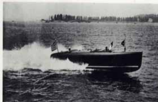
TEASER circa 1925.